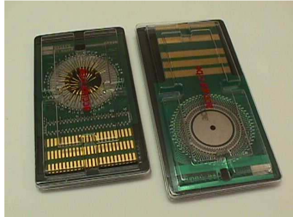
Probe Card Protectors

Probe card protectors provide a safe and secure way to protect and store probe cards when not in use. The protector covers provide a clear view of the contents and seal the container from dust and other contaminants. The PCP's are stackable or they can be stored in a rack.